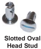
Slotted Oval Head Stud

DFS-R5200 .....0.200" spring receptacle DFS-R5225 .....0.225" spring receptacle DFS-R5250 .....0.250" spring receptacle DFS-R5275 .....0.275" spring receptacle DFW-P9400.....weld plate for self-ejecting studs (.062" thick)